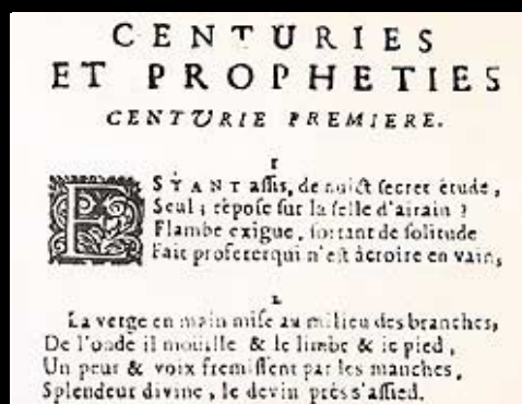
The first volume of the 'Prophecies'