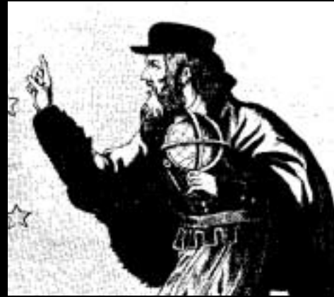
A 19th century caricature

WORLD EVENTS ARE NOTORIOUSLY DIFFICULT TO PREDICT. WAS THE 16 TH CENTURY FRENCH-BORN 'STAR-GAZER' THE GREAT SEER HIS MULTITUDE OF FOLLOWERS CLAIM? DID HE FORETELL THE COMING OF HITLER, THE GREAT FIRE OF LONDON, THE FRENCH REVOLUTION, THE ASSASSINATION OF JOHN F. KENNEDY?