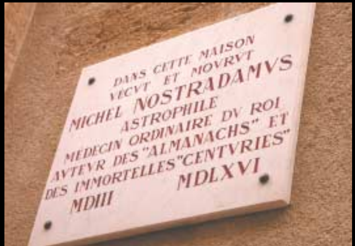
Plaque commemorating the life and works of Nostradamus on the walls of his former home in Salon de Provence, where he lived and died. The building now houses the Nostradamus Museum.

- Nostradamus admittedly refers to 'three brothers', but in terms that generally suggest the leaders of three allied nations in a future Muslim/Christian conflict, not a single dynasty. As for a nuclear attack on New York, the city is in fact never named; the widespread tradition (especially popular, curiously enough, among Americans) derives from VI.97 where a "grand cite neufve" on latitude 45 degrees is attacked with fire from the sky. New York itself lies well to the south. The reference is more likely to be to some town or city that, like Naples (Greek 'Neapolis' is actually named 'New City' - Villanova d'Asti in Italy, and Villeneuve sur Lot in France being the best geographical candidates.