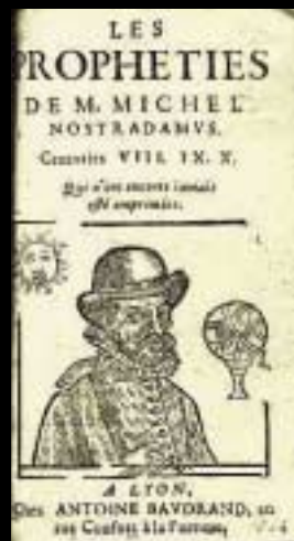
The 'Prophecies' volumes 8, 9 & 10