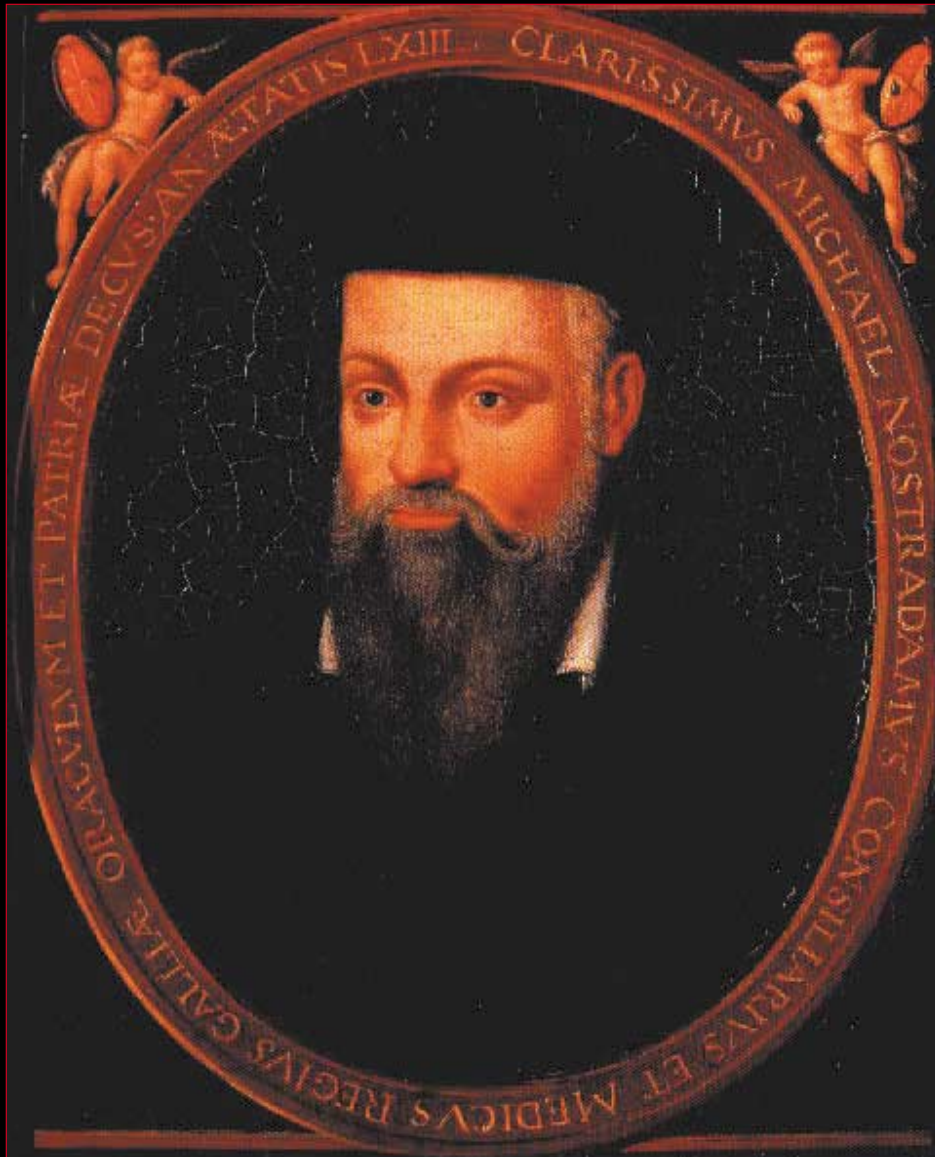
The Most Illustrious Michel de Nostredame, Bibliothèque de la Béjanes Royal Councillor and Physician, Prophet of France, and Pride of His Country, in his 63 rd year